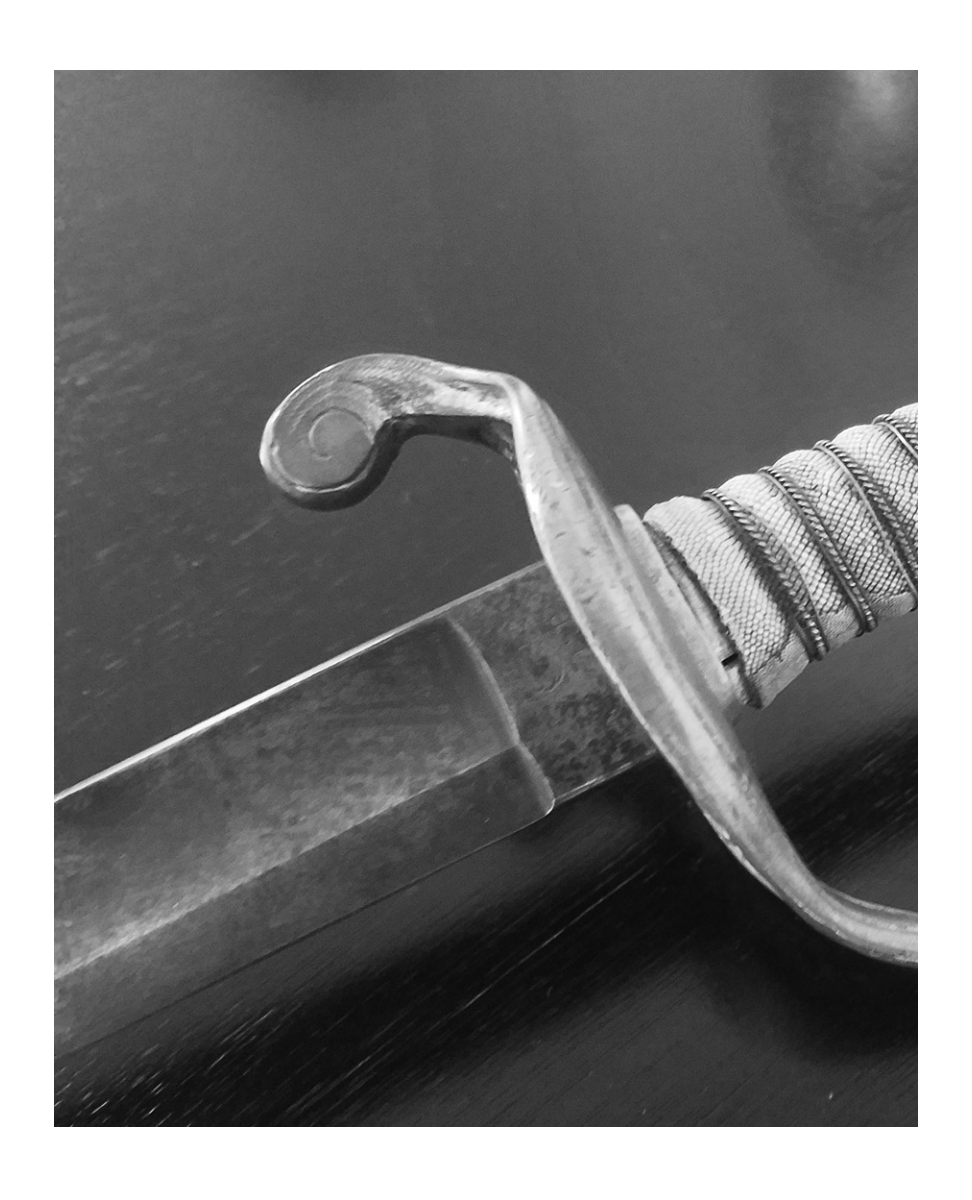
See It Now: Sword of Thomas Clarkson see page 6