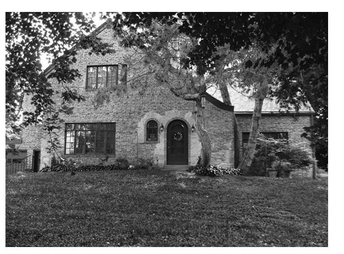
2223 Corona Road

Join us for the 2019 Tour of Homes and bring your friends. What a nice gift for your friends to ask them to join you on the Tour of Homes. This is our largest fundraiser each year. If you cannot attend, then please consider a tax free donation.